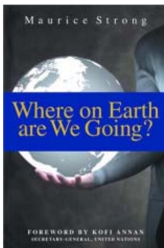
Maurice Strong's Autobiography "We are all gods now, gods in charge of our own destiny,"

Mr. Martin is fully committed to Mr. Strong and his radical agenda to implement this new spiritual vision. Paul Martin recently said "he's obviously somebody that a number of people, including the Secretary-General of the United Nations listens to, and I do too." Now as Senior Advisor Maurice Strong can follow-up on