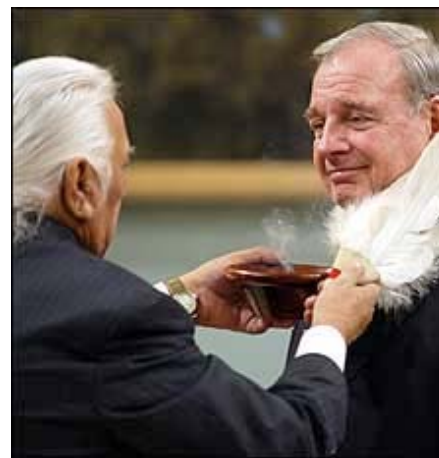
Smoke ceremony for new Canadian Prime Minister December 12 th in Canada's Parliament Building.

spiritual path on National TV as he invited an Aboriginal Chief to perform the Earth Worship "Smudge Ceremony" on him in the Rideau Hall at the swearing in ceremony to become Canada's Prime Minister. Paul Martin's comment to the press might be seen in a sinister light. "I think we're into one of the most exciting periods ever in Canadian history, where Canadian influence and Canadian leadership and Canadian example