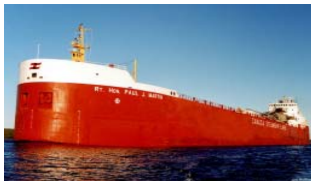
Rt. Hon. Paul J. Martin, Canada Steamship Lines

Our new Prime Minister is fully committed to the implementation of the precepts of the Earth Charter. This spiritual vision was drafted by Mr. Martin's now Senior Advisor and long term