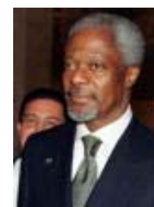
Kofi Annan UN Secretary-General Honorary President, University for Peace